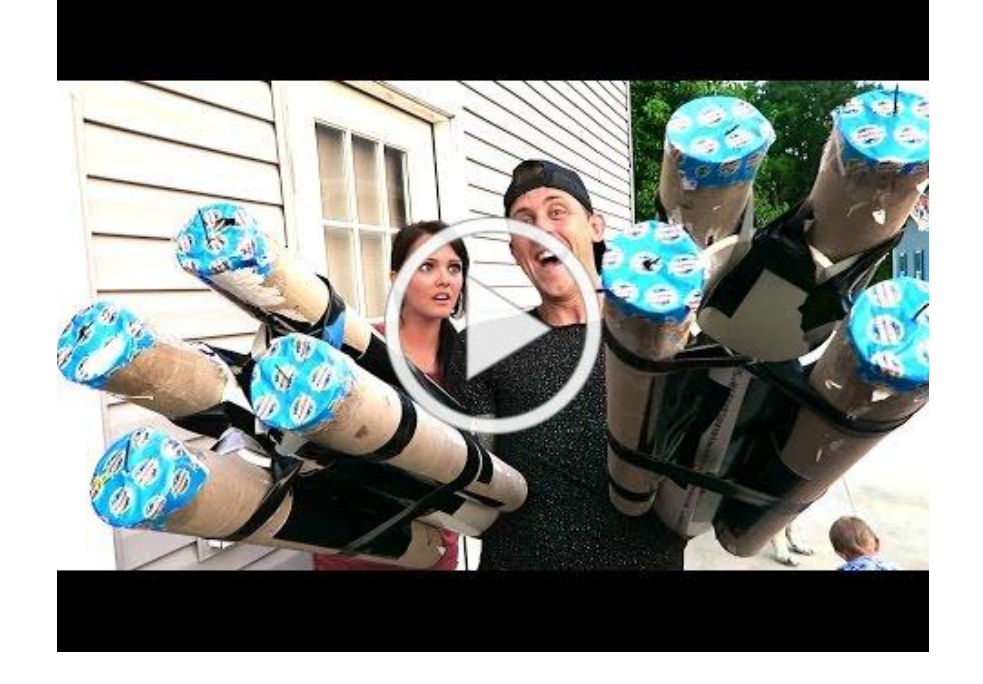
If not, keep reading >>>>